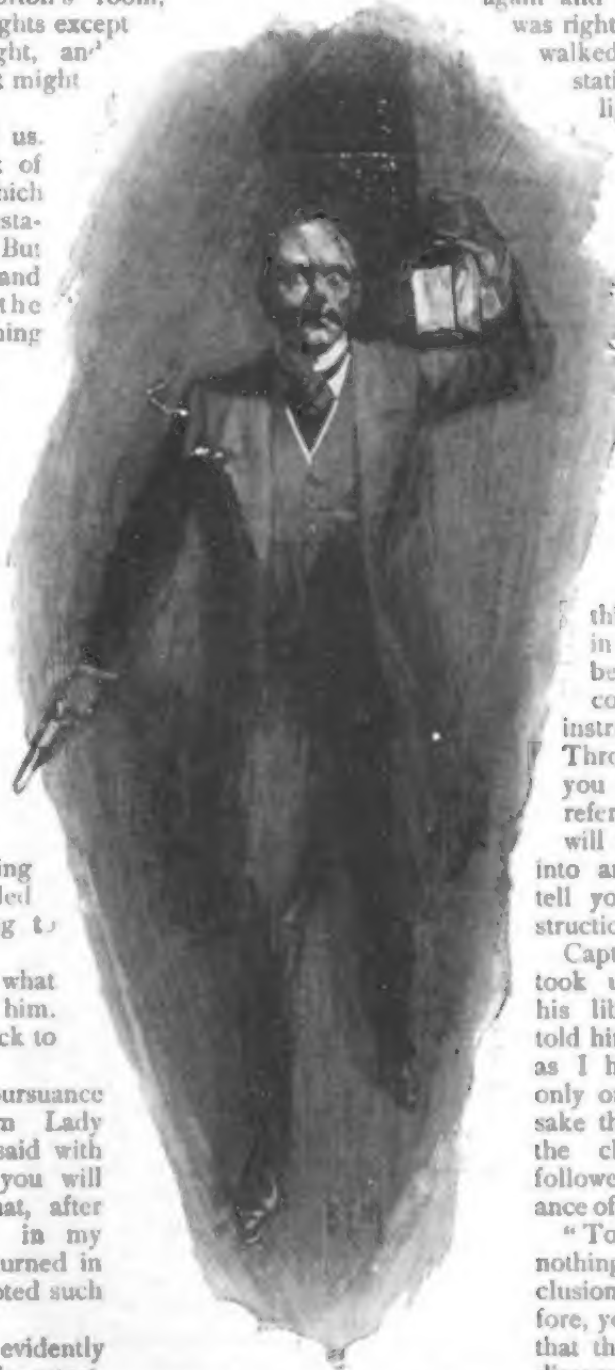
We beheld on the threshold Captain Throgmorton, with a lighted lantern in one hand, and a revolver in the other.

"To-night we have seen nothing," I said in conclusion. "I think, therefore, you may rest assured that the whole thing is a diseased imagination on the part of Lady Throgmorton, due to the state of her nerves."